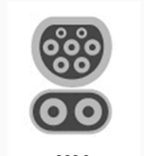
CCS 2 CONNECTOR TYPE